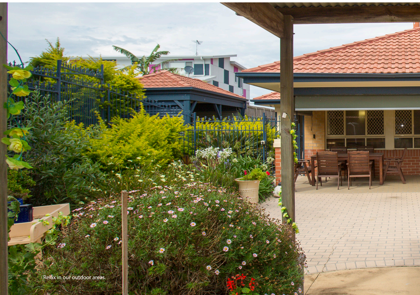
Relax in our outdoor areas.

Our boutique aged care centre offers professional personalised care in modern surroundings. Choose from a range of ensuite studios complete with kitchenettes, or experience specialised dementia care in a secure environment. A Registered Nurse is available on site to ensure you're well cared for.