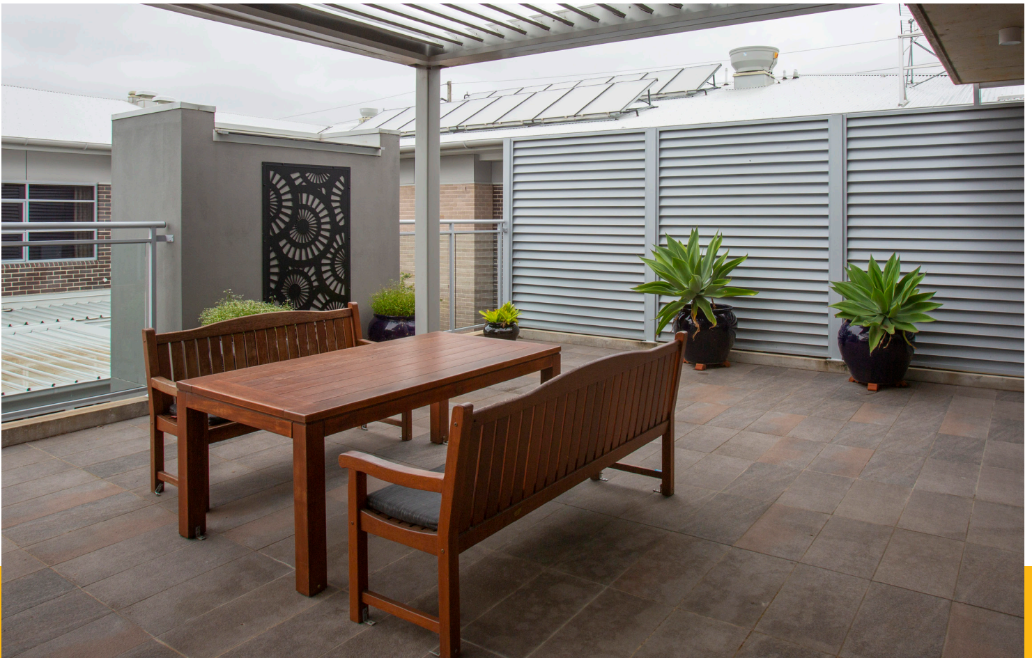
Top left - Receive professional care with a personal touch at IRT Tarrawanna.