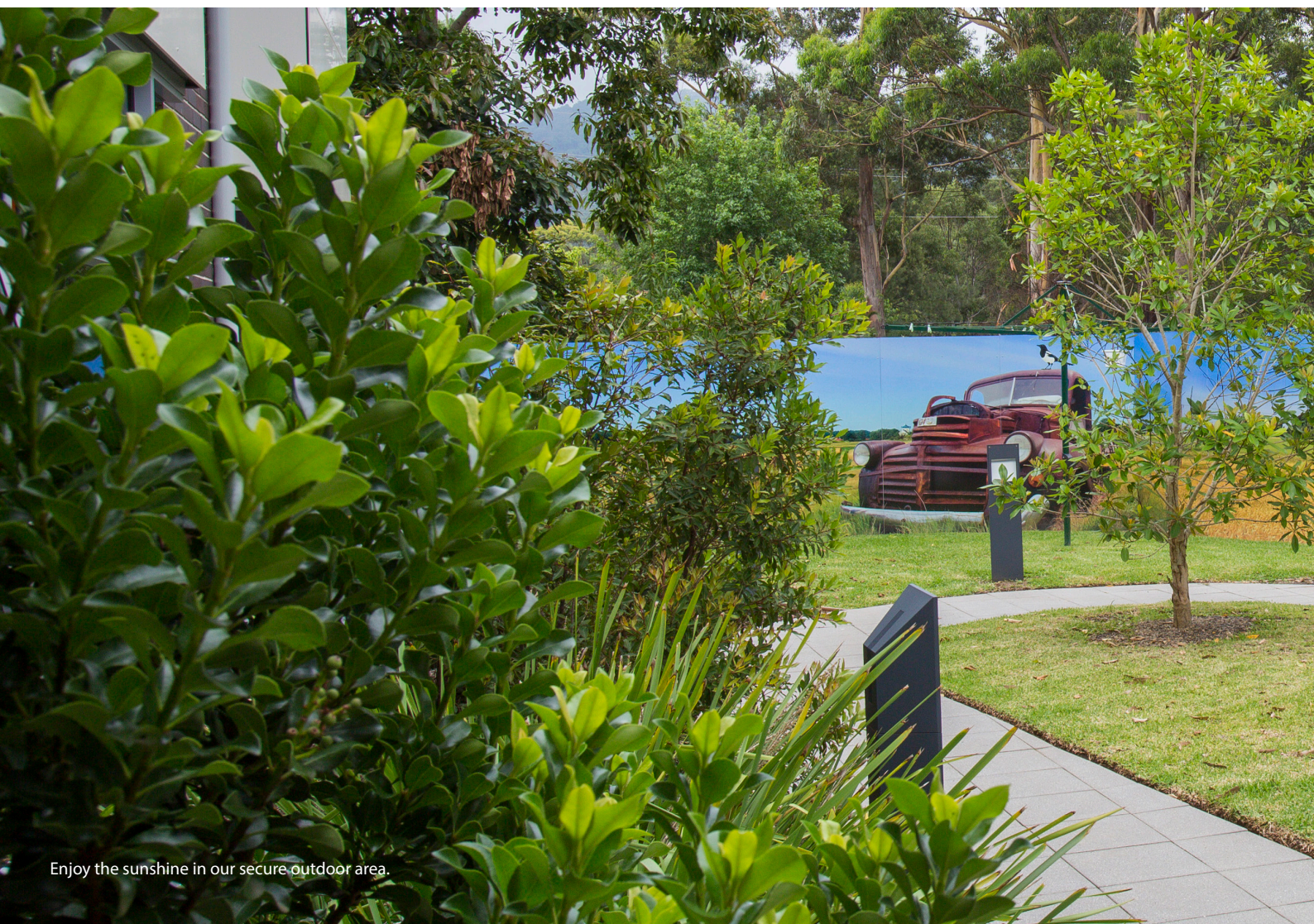
Enjoy the sunshine in our secure outdoor area.

Our aged care centre offers professional personalised care in superior surroundings. Choose from a range of spacious ensuite rooms or experience specialised dementia and palliative care in a secure environment. Built surrounding a central courtyard, all our suites are tastefully and elegantly designed and we encourage you to bring any photos or mementos from home to make your stay even more comfortable. Our experienced staff and Registered Nurses are on hand 24/7 ensuring you're comfortable and well cared for.