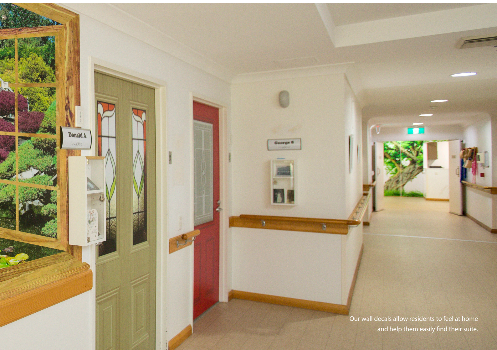
Our wall decals allow residents to feel at home and help them easily find their suite.