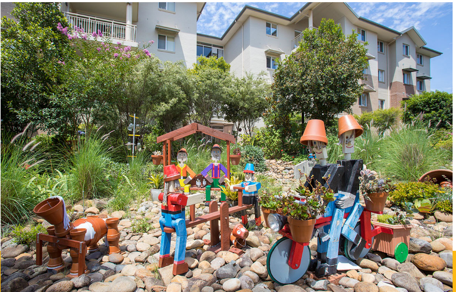
Top left - Relax in our secure outdoor areas.